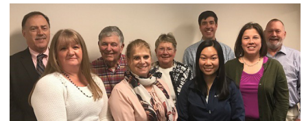
Healthcare and Safety Panel