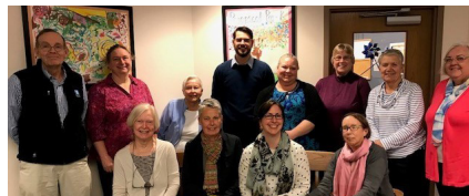
Healthy Community Connections Panel