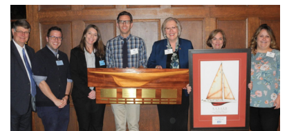
Mid Coast-Parkview Health team, holding the overall Excellence "Ranger" award.