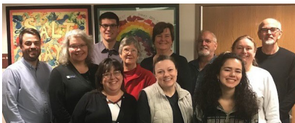
Basic Needs Panel

We had a wonderful, large group of people from across our communities reviewing 2019 applications for funding - 47 volunteers in total! They studied applications, asked questions of agencies, and came to consensus on the most effective programs meeting local people's most important needs . United Way is proud to bring this great level of accountability to our donors .