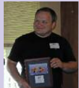
Gelato Fiasco "This business helped 29 non-profits last year through its delicious "Scooping for Community" Days!"