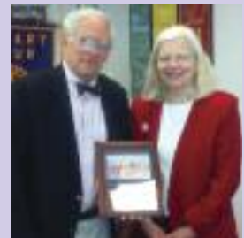
Judge Joe Field "Joe has looked beyond the courtroom to advocate for children and people in need"